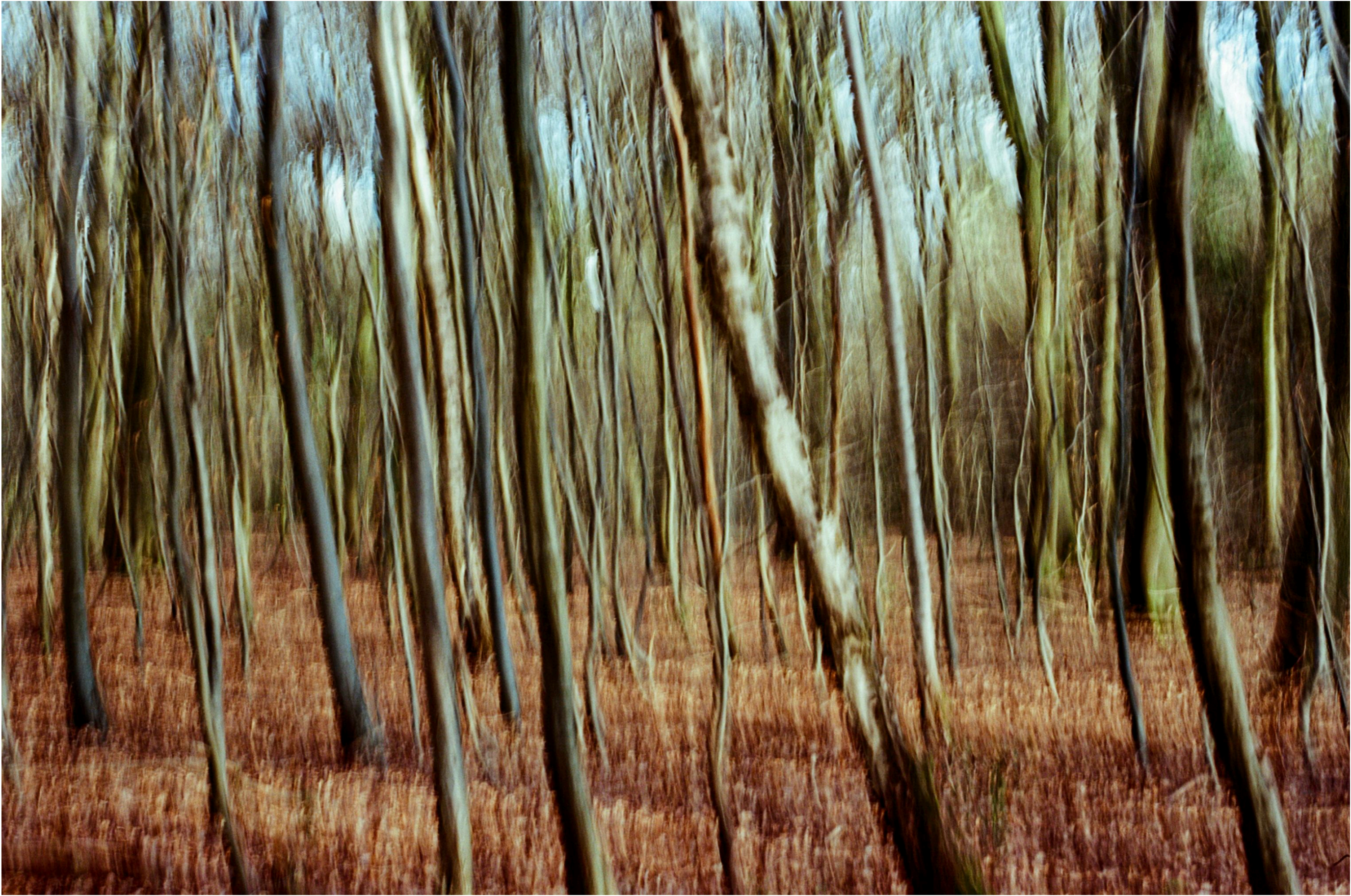
Polina Piëch, Through a Layered Path , 2025 (Printed 2025). C-type print on Fuji-flex paper mounted on aluminium. 122 x 176 cm, with frame. Courtesy of Roman Road and the artist.

Polina Piëch: Painted Winds: Fall at Dawn